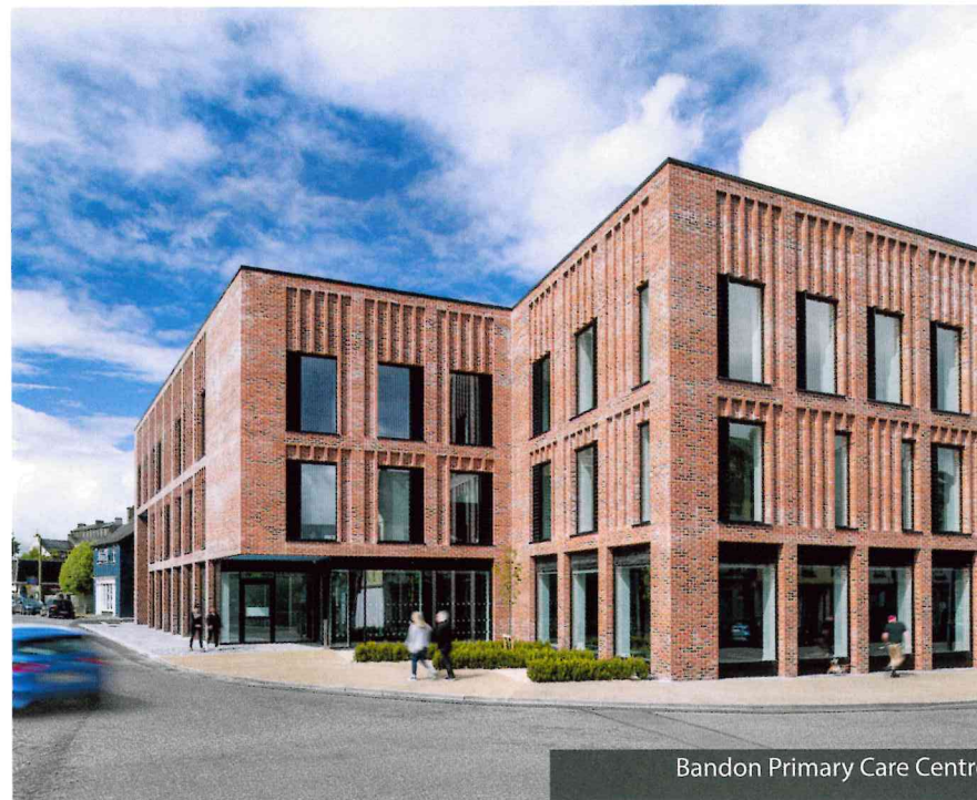
Bandon Primary Care Centre

Most uniquely, the company has a Specialist Works Division, who pride themselves on completing bespoke building projects, conservation works, and projects for the Irish Naval Service.