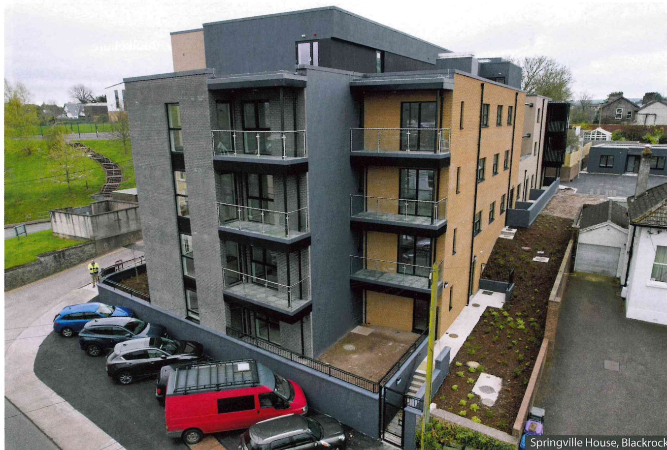
Springville House, Blackrock

"It was a life-changing experience which