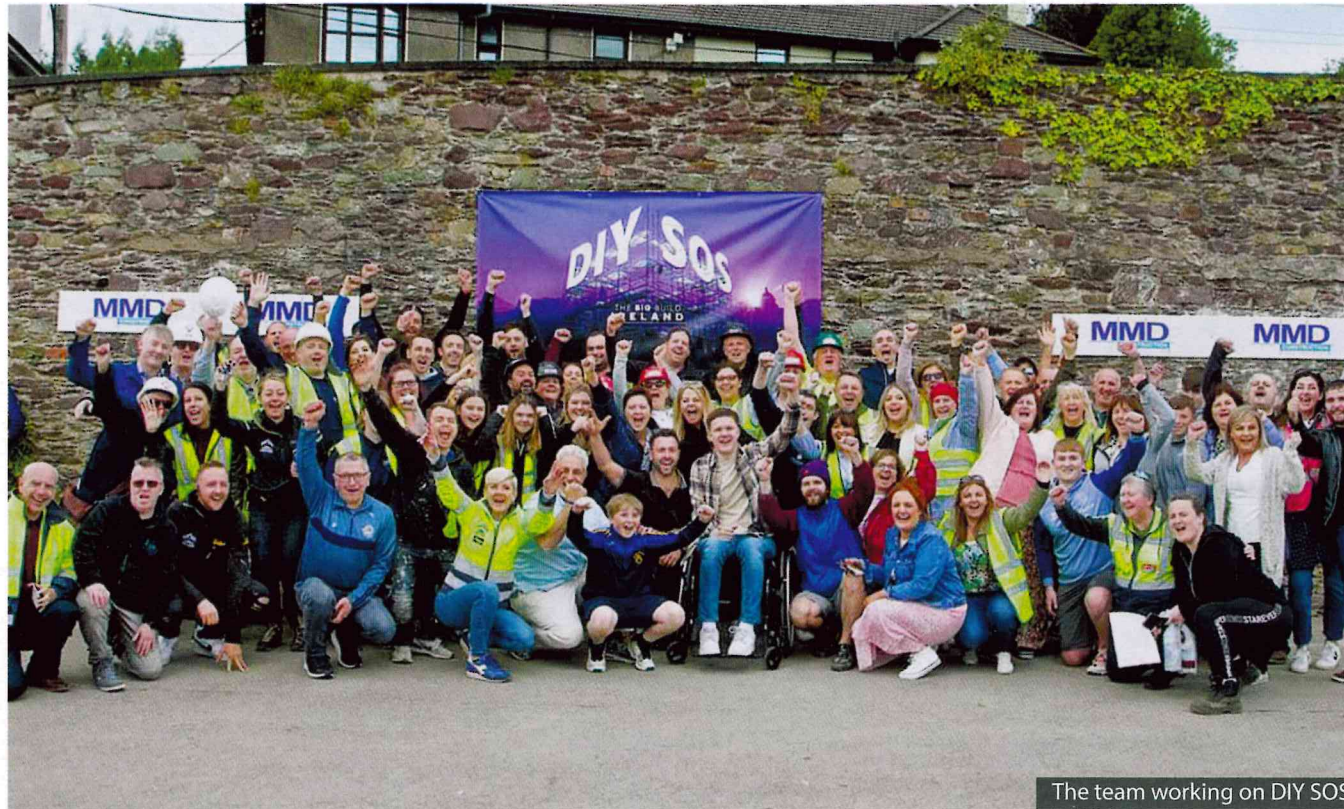
The team working on DIY SOS