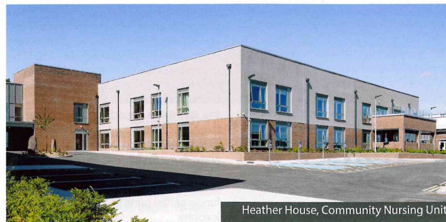
Heather House, Community Nursing Unit