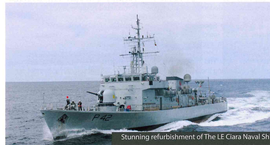
Stunning refurbishment of The LE Ciara Naval Ship

impact on the lives of a very deserving family.