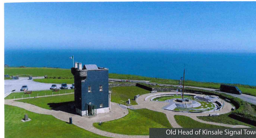
Old Head of Kinsale Signal Tower

I'd gladly do again in the morning. The goodness that came out in people was something to behold. They came from all over Ireland to help out. It was a privilege to work with such a fantastic group of volunteers and suppliers, and to have had the opportunity to make a positive