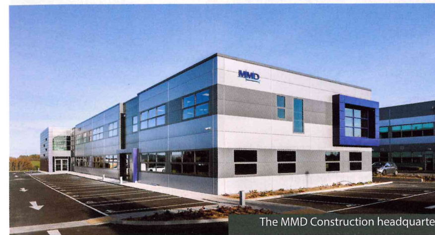
The MMD Construction headquarters