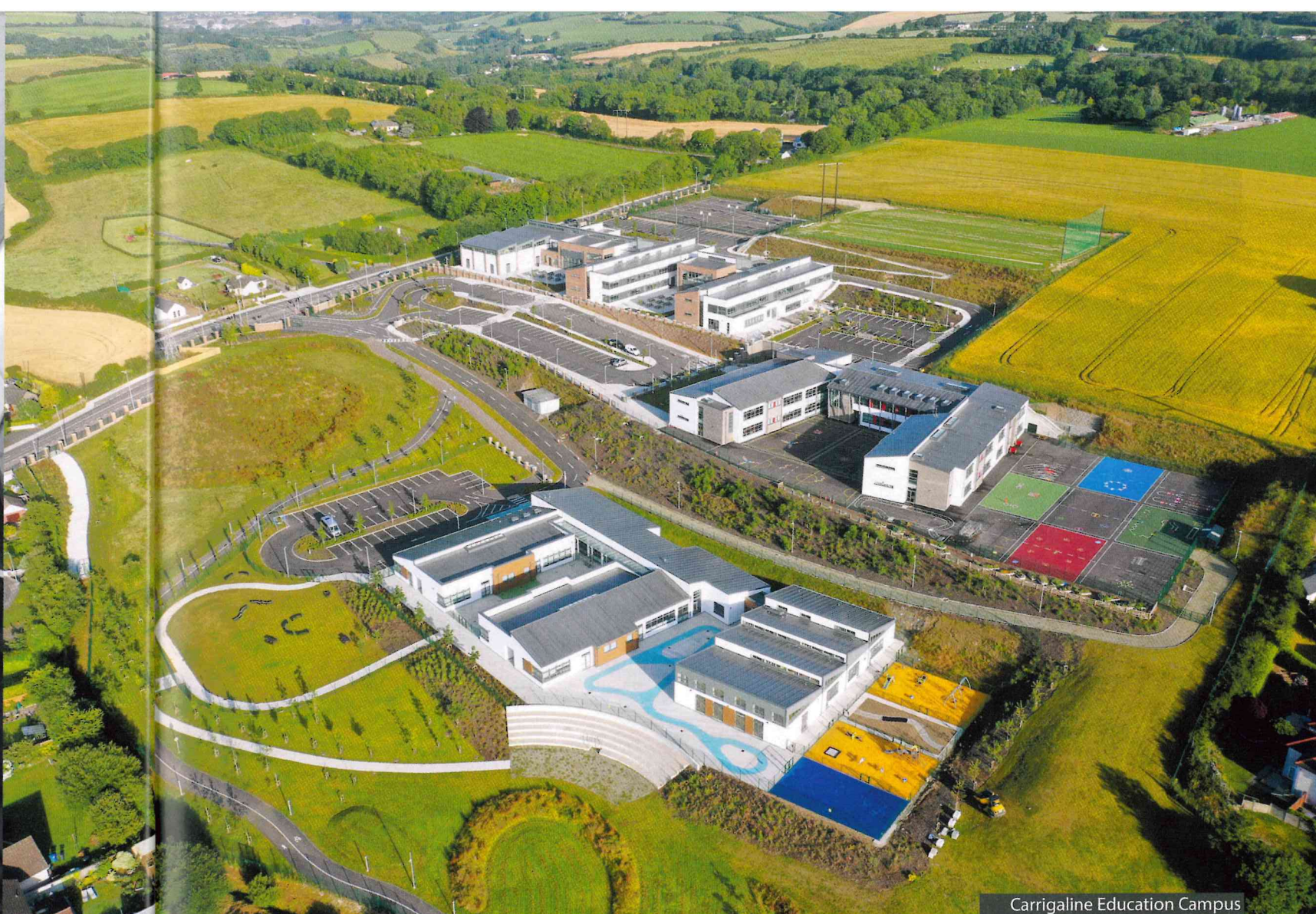
Carrigaline Education Campus