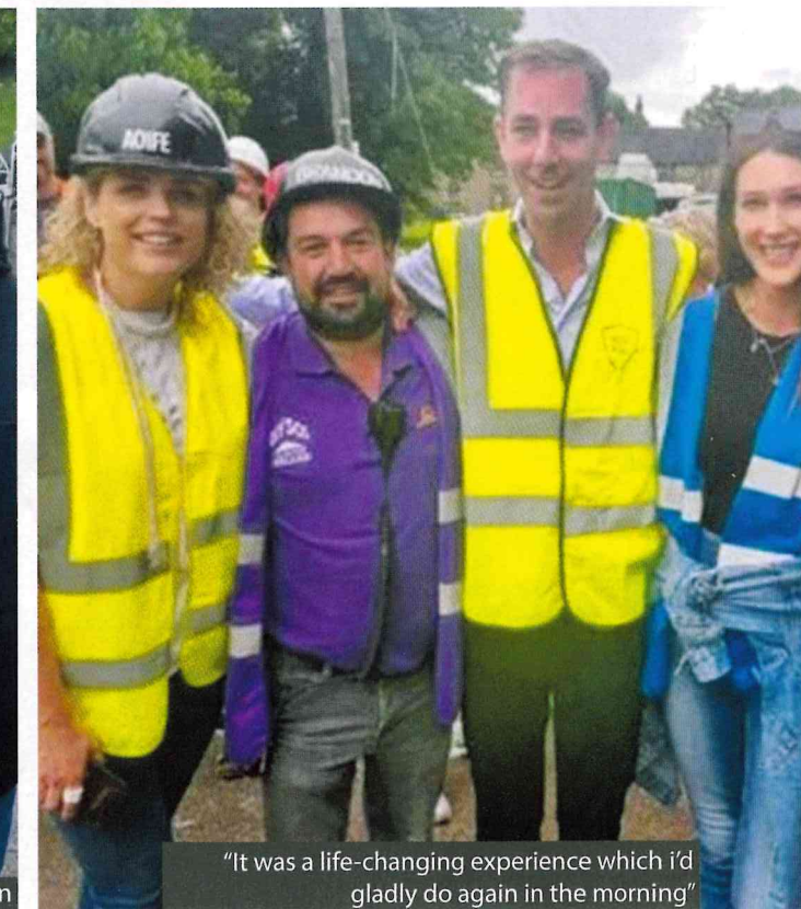
“It was a life-changing experience which I’d gladly do again in the morning”